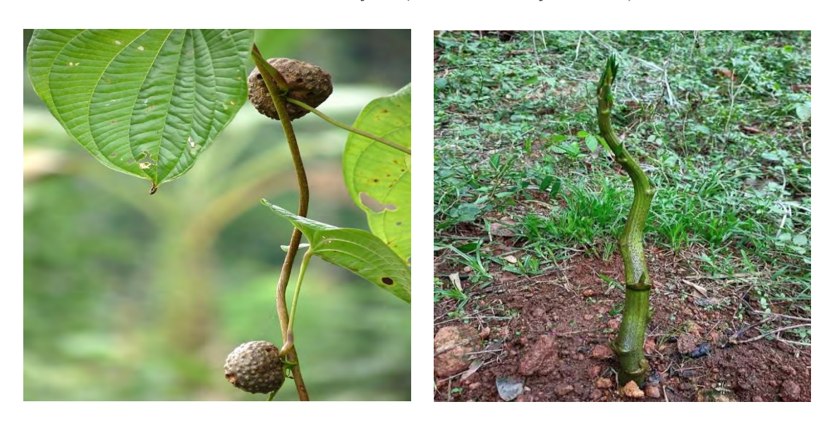
Figure 4. Dioscorea bulbifera plant (Dioscorea bulbifera, 2023).

• Binomial name: Dioscorea bulbifera (Dioscorea bulbifera, 2023)