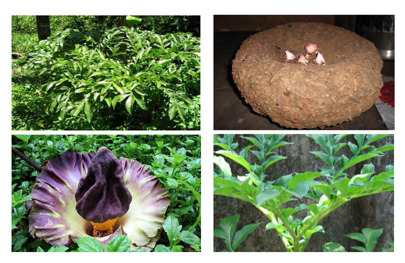
Figure 2. Amorphophallus paeonifolius plant (Amorphophallus paeoniifolius, 2023).