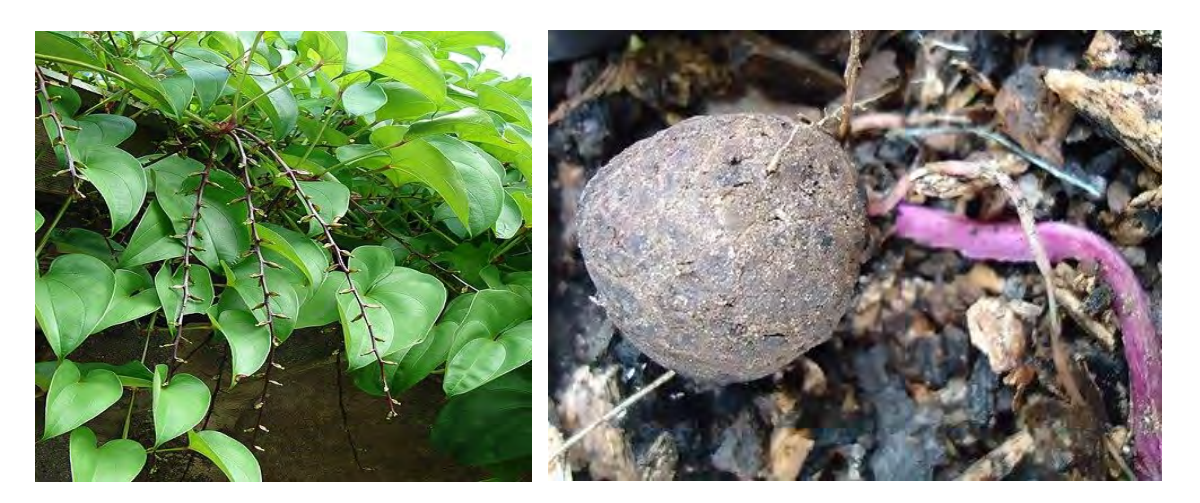
Figure 3. Dioscorea alata plant (Dioscorea alata, 2023).