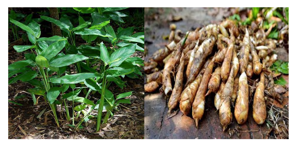
Figure 6. Maranta arundinacea plant (Maranta arundinacea, 2023).

• Binomial name: Maranta arundinacea L (Maranta arundinacea, 2023).