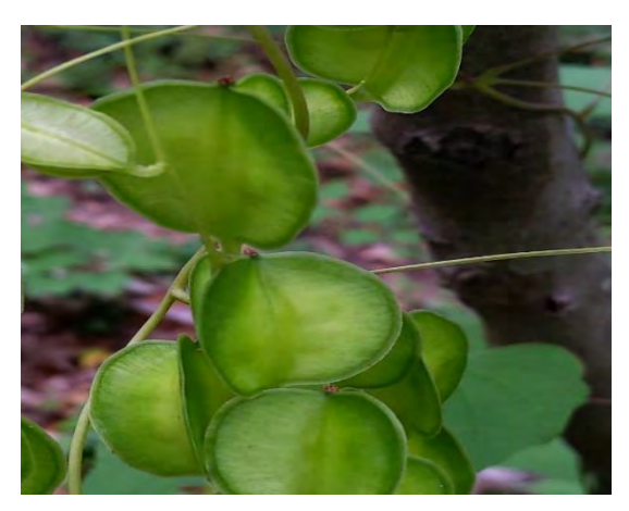
Figure 5. Dioscorea sativa plan (Dioscorea villosa, 2023).